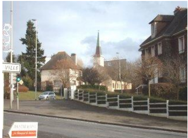
Le Temple at Condé and its surrounding area

A joint (bilingual) service was held with the ERF on Good Friday evening. More than 30 were present, with English-speakers perhaps being in the majority. We sang hymns in French and English - simultaneously! - and also a metrical version of the Apostle's Creed in English. There were prayers, Bible readings and meditations on those readings, some in English and some in French. It was a time for all to be together, whatever nationality or