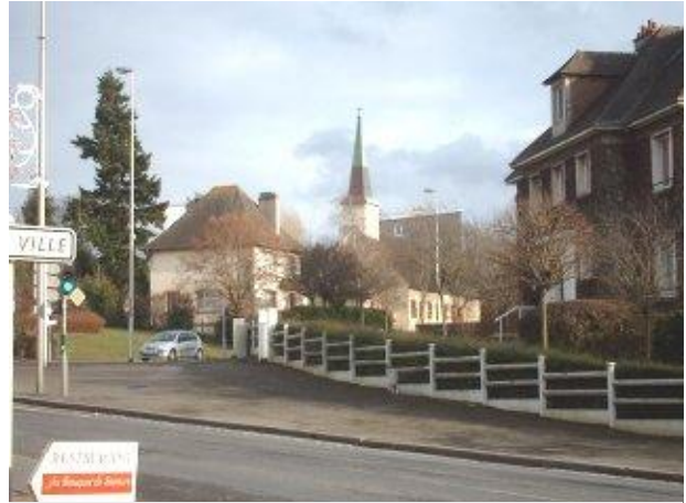
Le Temple at Condé and its surrounding area

A joint (bilingual) service was held with the ERF on Good Friday evening. More than 30 were present, with English-speakers perhaps being in the majority. We sang hymns in French and English - simultaneously! - and also a metrical version of the Apostle's Creed in English. There were prayers, Bible readings and meditations on those readings, some in English and some in French. It was a time for all to be together, whatever nationality or