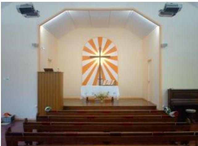
Inside the Le Temple at Condé

Numbers attending have gone up from the mid-teens in January to more than 25 at our Palm Sunday service, though only about 20 came on Easter Sunday due to family commitments. New people are coming along to each service, so numbers continue to grow.