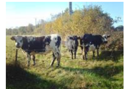
Some of Normandy's large population of cows.