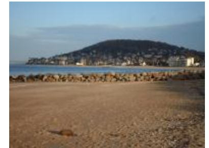
View of Houlgate from across the mouth of the River Dives