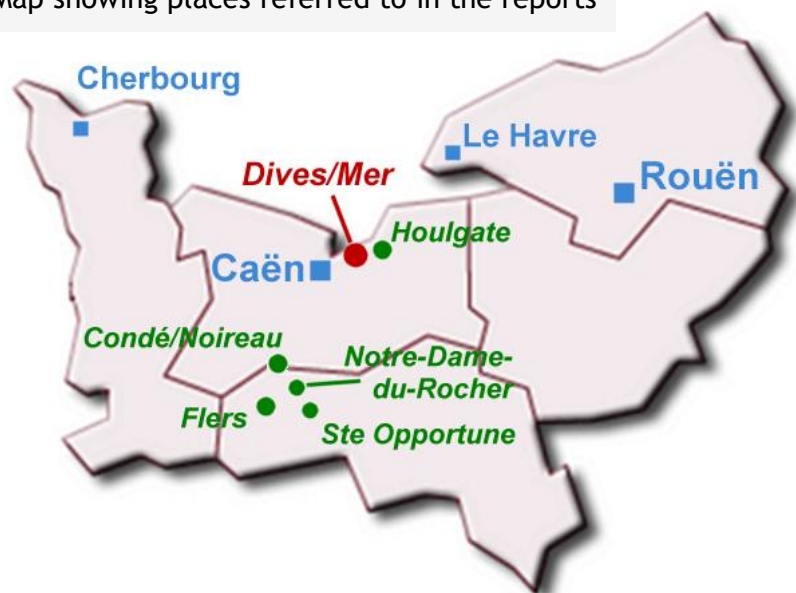
Map showing places referred to in the reports

There is a need to get hold of some English Bibles for use in our work. As well as being used in the developments planned for the Flers region, they are also needed for the summer English language services at Houlgate. For some visitors English is their second language, so having the English text in front of them would make following the lessons much easier. During past summers we have printed the lessons in "handouts" each Sunday morning, but having Bibles would be preferable.